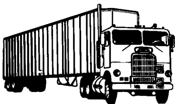
Tag on Truck